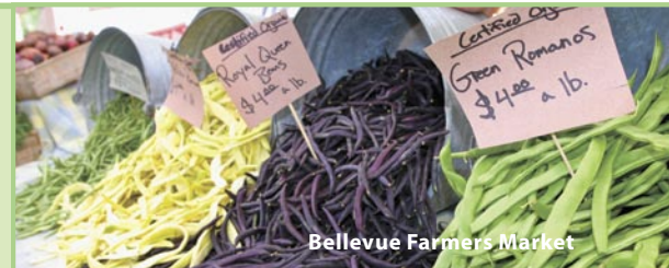
Bellevue Farmers Market

Saturday, July 11 and Sunday, July 12, Mercerdale Park. This year's theme is "Around the World."