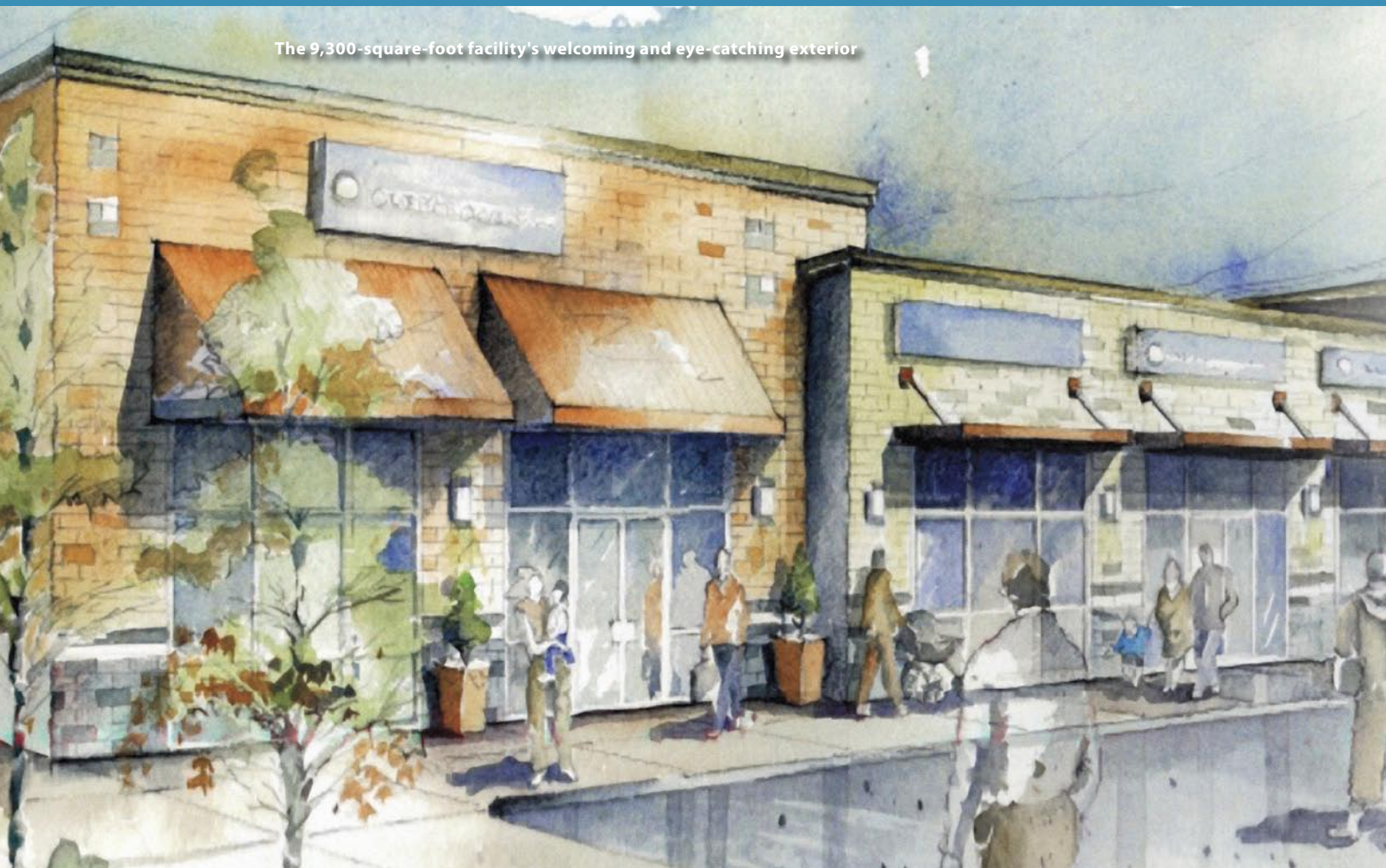
The 9,300-square-foot facility's welcoming and eye-catching exterior

W hen the new Overlake Medical Center Issaquah opens its doors this summer, patients in the Issaquah area will have greater access to first-rate healthcare than ever before. The facility, located at 5708 E. Lake Sammamish Parkway SE, will offer both an improved patient experience and greatly expanded healthcare services. Now, under one roof, patients will find the Urgent Care Clinic, Anticoagulation Clinic, Breast Screening Center and Women's Clinic, as well as primary care physicians and a classroom for community education.