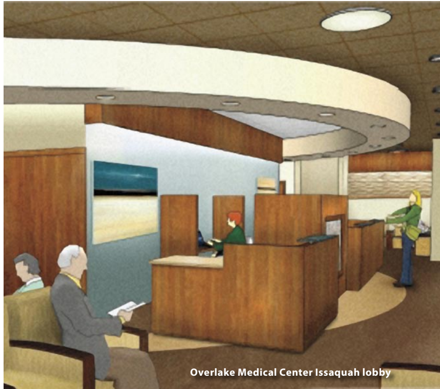
Overlake Medical Center Issaquah lobby