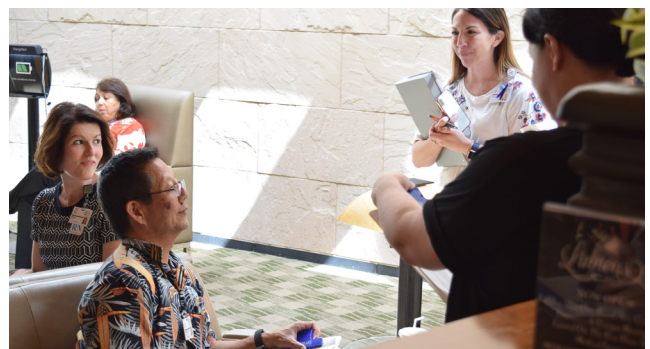
Staff members assigned to portray loved ones anxiously awaited news.