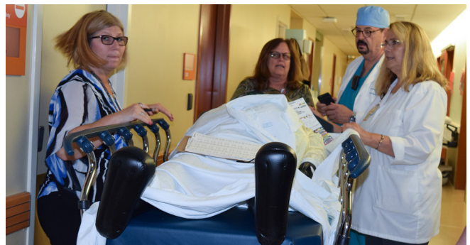
Overlake Emergency Department staff members swung into action.