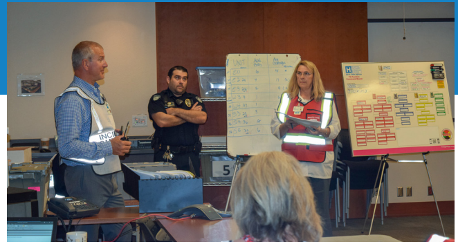
An Incident Command Center was opened at Overlake as soon as the drill began.

Your support helped make this readiness exercise possible. Thank you for your commitment to the safety and well-being of our community.