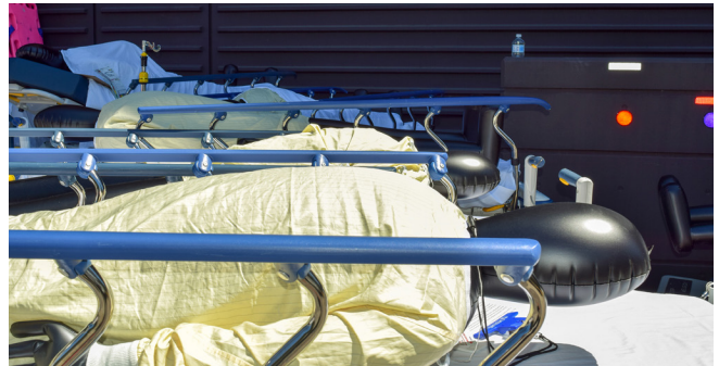
"Patients" arrived at Boeing Field and were transported to Overlake for treatment.