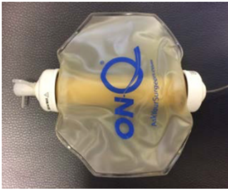
An empty pump.