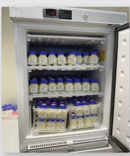
The Baby Boutique (top) offers an assortment of fun and necessary items for newborns and moms. The Milk Bank provides donated, pasteurized breastmilk for babies in need.

Center Foundation, please call 425.688.5525 or email solicitationopt-out@overlakehospital.org.