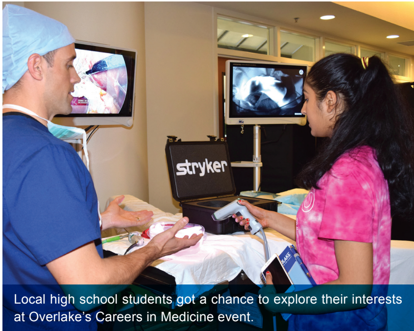
Local high school students got a chance to explore their interests at Overlake's Careers in Medicine event.